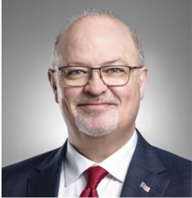
Hon. Fred Hutton Minister of Tourism, Culture, Arts and Recreation

Welcome to the 2025 Tuckamore Festival, marking the 25th anniversary of this fantastic event.