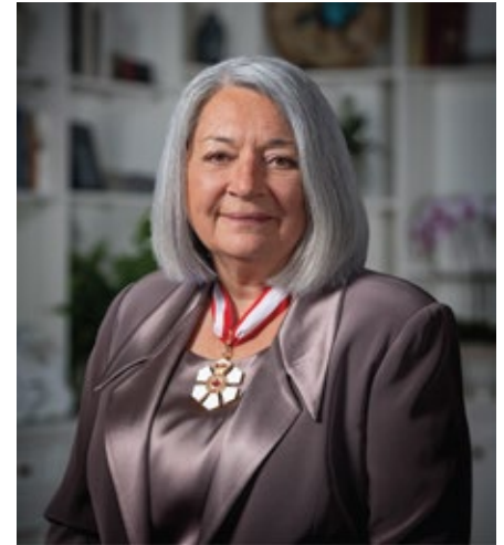
Her Excellency the Right Honourable Mary Simon, Governor General of Canada

THE GOVERNOR GENERAL • LA GOUVERNEURE GÉNÉRALE