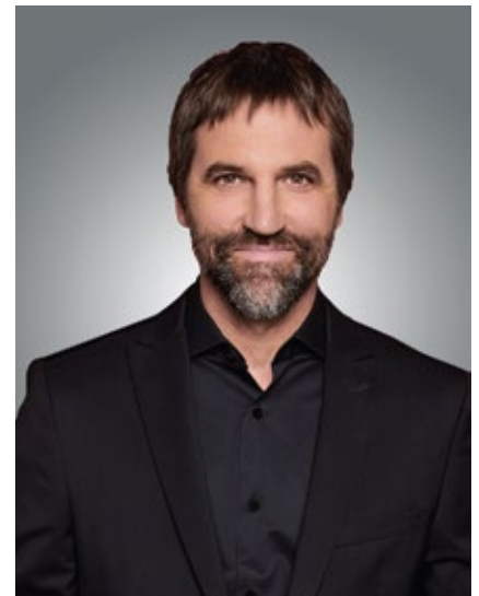
The Honourable Steven Guilbeault